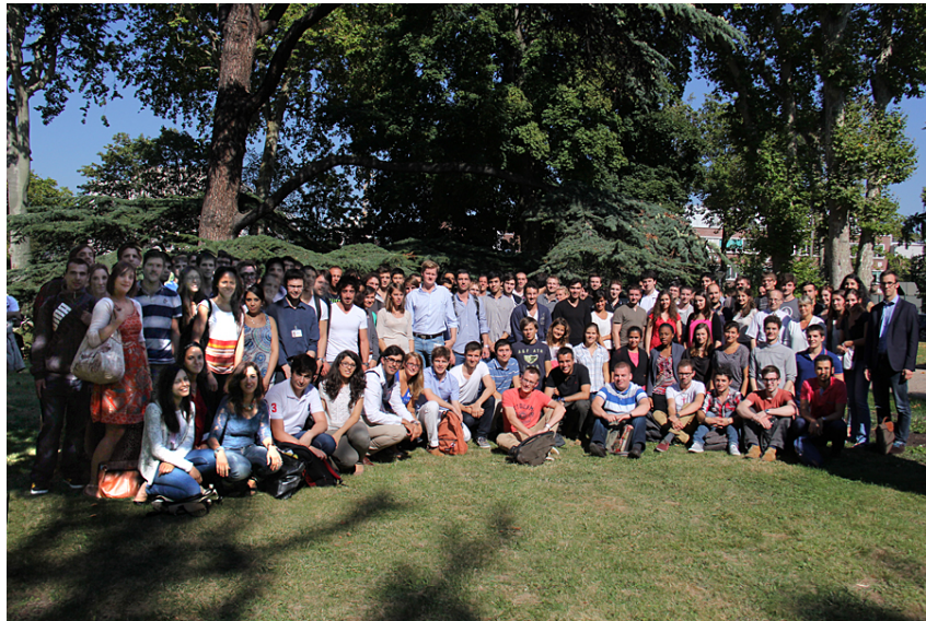
146 new apprentices joined IFP School at the beginning of September.

Of the 137 apprentices on the engineering programs, 31 are "Bac + 4" (four years of higher education).