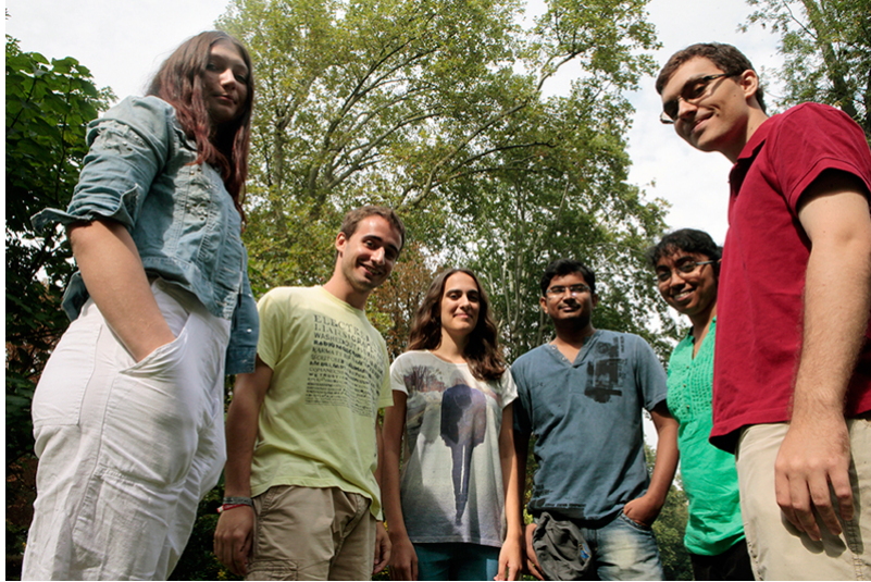
This year, IFP School and the Tuck Foundation hope to be able to finance scholarships for these six students from the 2013-2014 Class.